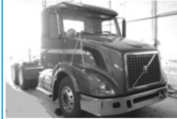
2005 Volvo VNL64T, Cum. ISX 400 hp, C-brake, FRO16210C, 178" WB, painted blue, only 432K miles.