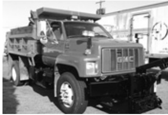
'00 GMC C8500, Cat 250 hp, MT653DRD AL, A/C, pwr. windows & locks, 10' Heil dump, 11' blade & spreader, only 123K miles.