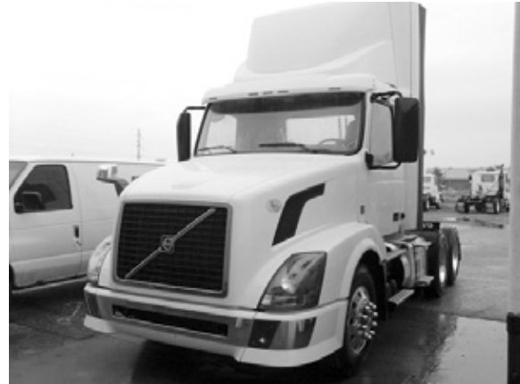
2013 VNL64T300, D13, 425 hp, Eaton Fuller 10 spd., day cab, #5170.