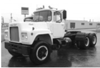
'81 Mack R686, 300 hp, (2) sticks, camelbacksusp., completely straight, only (2) owners, 106K miles.