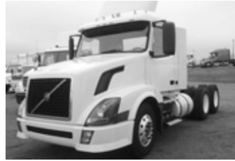
'05 Volvo VNL64T, VED 12, 435 hp, Jake, 10 spd. O.D., 174" WB, 3.90 ratio, only 434K miles.