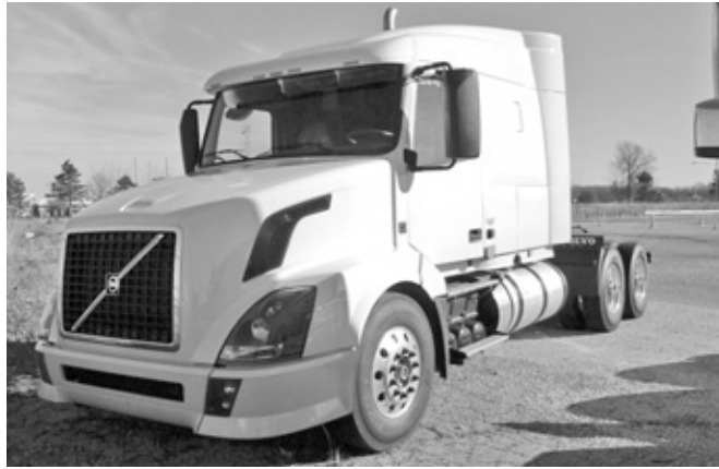
(2) 2013 VNL 630's, 61" midroof, D13 455 hp, Eaton Fuller, 10 spd, #5164/65.